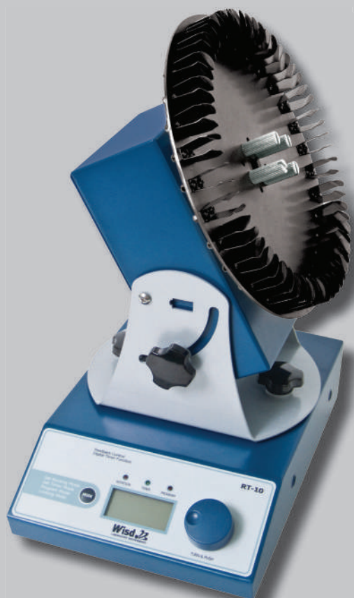
RT-10 with disk WRT120