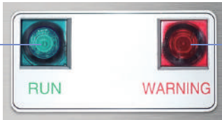
Indicator of KTR model