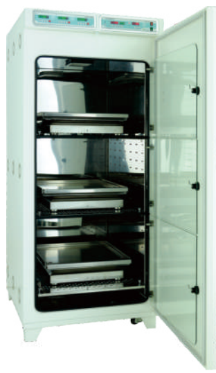
Inner doors Open