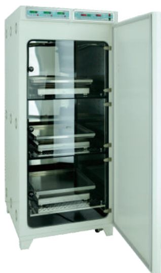
Outer door Open