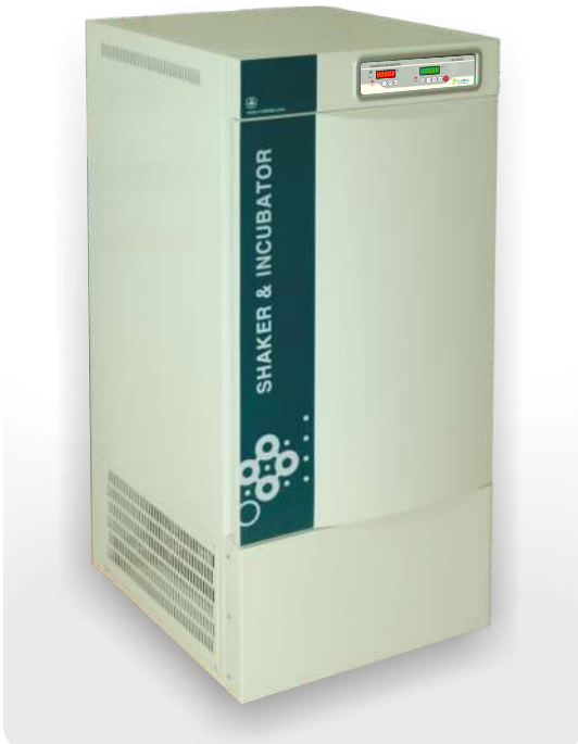
NB-205VQ (230Liter with Medium Shaker)

These incubators have built-in shaker for suspension cell culture as well as shelves for adherent cell culture. Optimized cooling function provides wide range of temperature.