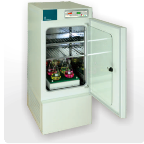
NB-205QF (134Liter with Mini Shaker)