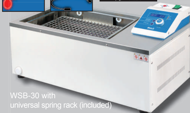
WSB-30 with universal spring rack (included)