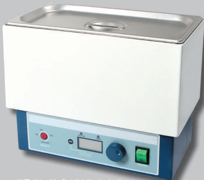
WB-11 with flat lid (included)