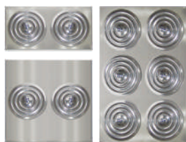
Lid with concentric ring, stainless steel