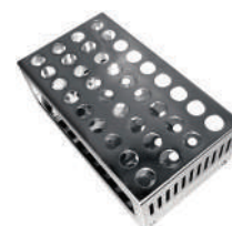
Tube rack, stainless steel