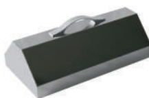
Dome lid for water bath WB, stainless steel